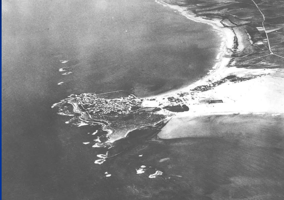
Aerial View of Tyre

The people of Tyre were fond of money and very cruel (Ezekiel 26-28, and Isaiah 23). Amos spoke against the people of Tyre. They had attacked the Israelites when they were weak. Then they sold the Israelites as slaves to their worst enemies, who were the people in Edom (Amos 1:9, 10).