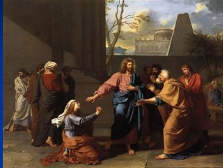
Christ and the Canaanite Woman Germain Jean Drouais

Jesus leads his disciples to the district of Tyre and Sidon. “And a Canaanite woman from that region came out and began to cry out, saying, ‘Have mercy on me, Lord, Son of David; my daughter is cruelly demon-oppressed.’ But He did not answer her a word. And His disciples came and implored Him, saying, ‘Send her away, because she keeps shouting at us. But He answered and said, ‘I was sent only to the lost sheep of the house of Israel.’ But she came and began to bow down before Him saying, ‘Lord, help me!’ And He answered and said, ‘It is not good to take the children’s bread and throw it to the dogs.’ But she said, ‘Yes, Lord; but even the dogs feed on the crumbs which fall from their masters’ table. Then Jesus said to her, ‘O woman, great is your faith; it shall be done for you as you wish.’ And her daughter was healed at once”(Matt. 15:21-28).